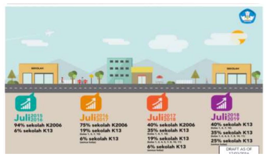
Figure 2. Road Map of Impementation of Curriculum 2013