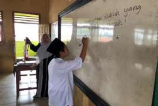
Figure 4. Students are writing their LKPD results on the blackboard

DOI: https://doi.org/10.31004/basicedu.v6i1.1841