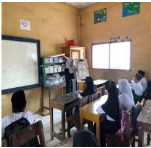
Figure 3. Implementation of the learning process using the circulatory bottle

Second, implementation. In the implementation of the learning process using the circulatory bottle props by the teacher, namely: a). The teacher prepares students and explains to students what will be learned and why it is important to learn so that students' curiosity arises; b). The teacher asks students to browse through the material first by reading the LKS book; c). After the students finished reading the LKS book, the teacher asked questions to find out the students' initial knowledge about the material of the human circulatory organ; d). The teacher introduces the circulatory bottle prop that will be used when learning and students respond to it, and try to interact directly with the teaching aid media; e). The teacher explains the core material, namely how the heart works, small and large blood circulation by demonstrating the circulatory bottle props; f). After finishing explaining the material, the teacher invites students to ask if there is the material that has not been understood; g). The teacher invites some students to re-enact the circulatory bottle props so that students can know how to use the props correctly; h). The teacher ensures that all students understand the material that has been explained.