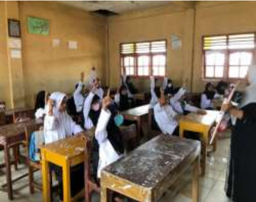
Figure 5. The state of student participation when the learning process takes place

The participation that the researcher means is the active participation of students in learning activities which is a tangible form of student behavior in learning activities which is the totality of a mental and emotional involvement of students so as to encourage them to contribute and be responsible for the achievement of a goal, namely the achievement of learning achievement. satisfactory.