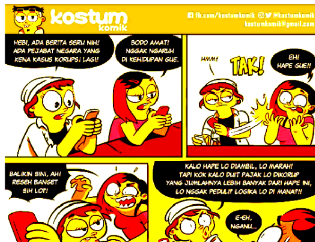
Figure 2. Developing of Comic

Multimedia elements are incorporated into each piece of material in order to make it more interesting to the audience. Comics were added to the first material, which covered the definition of corruption and the factors that contribute to corruption; several videos were added to the second material, which covered the different types of corruption, if time permitted; posters were added to the third material, which covered the massive impact of corruption and the efforts to eradicate corruption; and values and principles were added to the fourth material. The anti-corruption snippet includes footage from a television program in which a prominent anti-corruption figure is discussed.