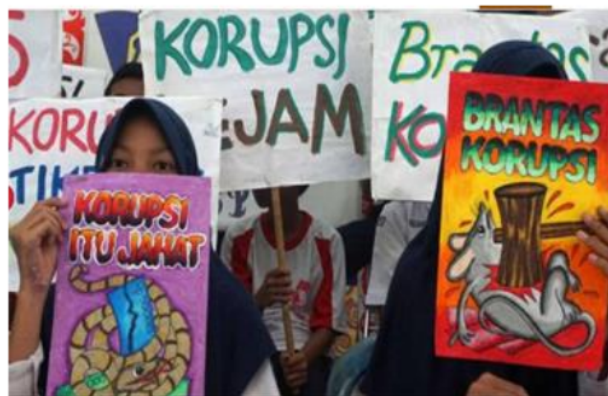
Figure 3. Development of Poster