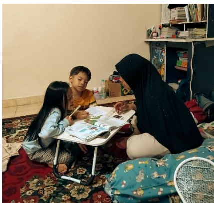
Figure 1. Managing Time Together with Children