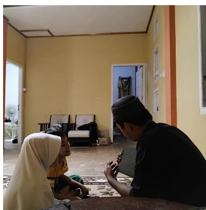
Figure 2. Implementation of Digital Technology in Learning

Figure 1 illustrates the approach taken by millennial parents in their efforts to spend time with their children, in this case, millennial parents are accompanying their children in reviewing school lessons. Meanwhile, Figure 2 shows the process of implementing digital technology as a learning aid for children in the era of digital transformation. The researcher is directly involved as a private tutor or in a supporting role in the implementation of digital technology, which aligns with the desires of millennial parents in their role as facilitators of their children's learning.